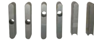
AAK-YAM Key Set to Suit Yamaha O/B