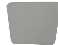
TP105 Transom Mounting Pad Lge 1 Piece