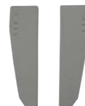
TP100Y Transom Mounting Pad Yamaha