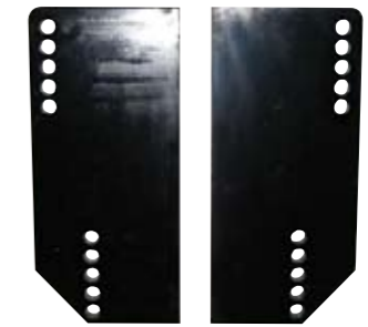
VRD-BP Verado Backing Pads Set