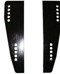
V6-BP V6 Backing Pads Pair