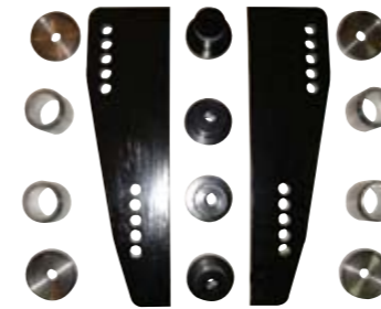
V6-VSKNK Bush Kit With Pads No Keys. V6