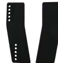
Ultra High Density Outboard Mounting Pads