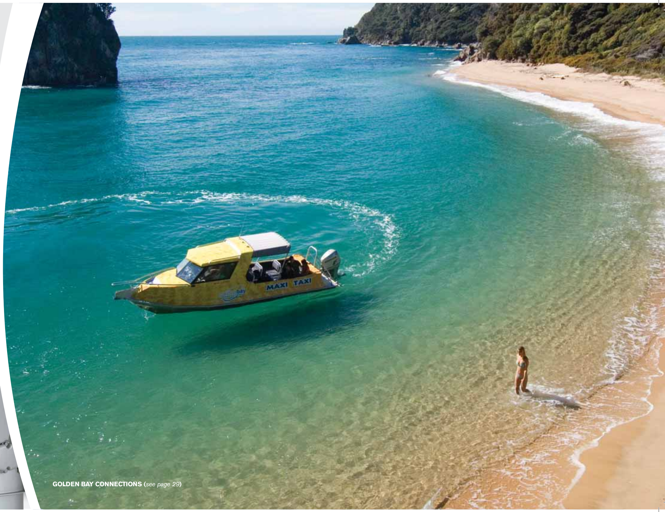
GOLDEN BAY CONNECTIONS (see page 29)