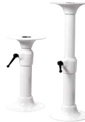
Table Pedestal fixed top Rise & Fall

Specifically designed for the purpose of supporting a table. These are all aluminium, height adjustable pedestals with fixed top. All castings are marine grade aluminium alloy. Top removable by 2 x S/S grub screws. All moving parts are separated by plastic bushing for smooth lasting operation. Future disassembly is very easy with no special tools required.