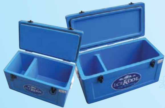
IK45D 47L Ice Chest with 2 compartments IK85D 85L Ice Chest with 2 compartments